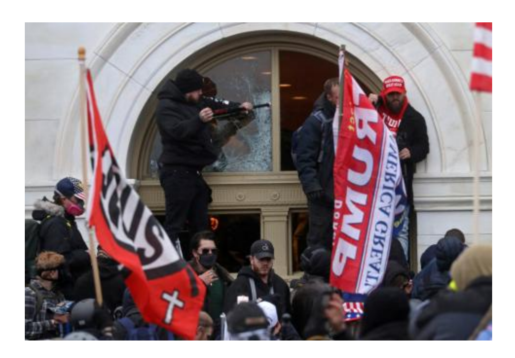
A President Donald Trump supporter breaks a window at the U.S. Capitol in Washington Jan. 6, 2021.

Every newspaper, every news program, is talking about him nonstop. The media know that stories about Trump increase their ratings and therefore advertising revenue. Trump knows how to use the media to his advantage. The traditional media know they are being used, but also know they cannot ignore him.