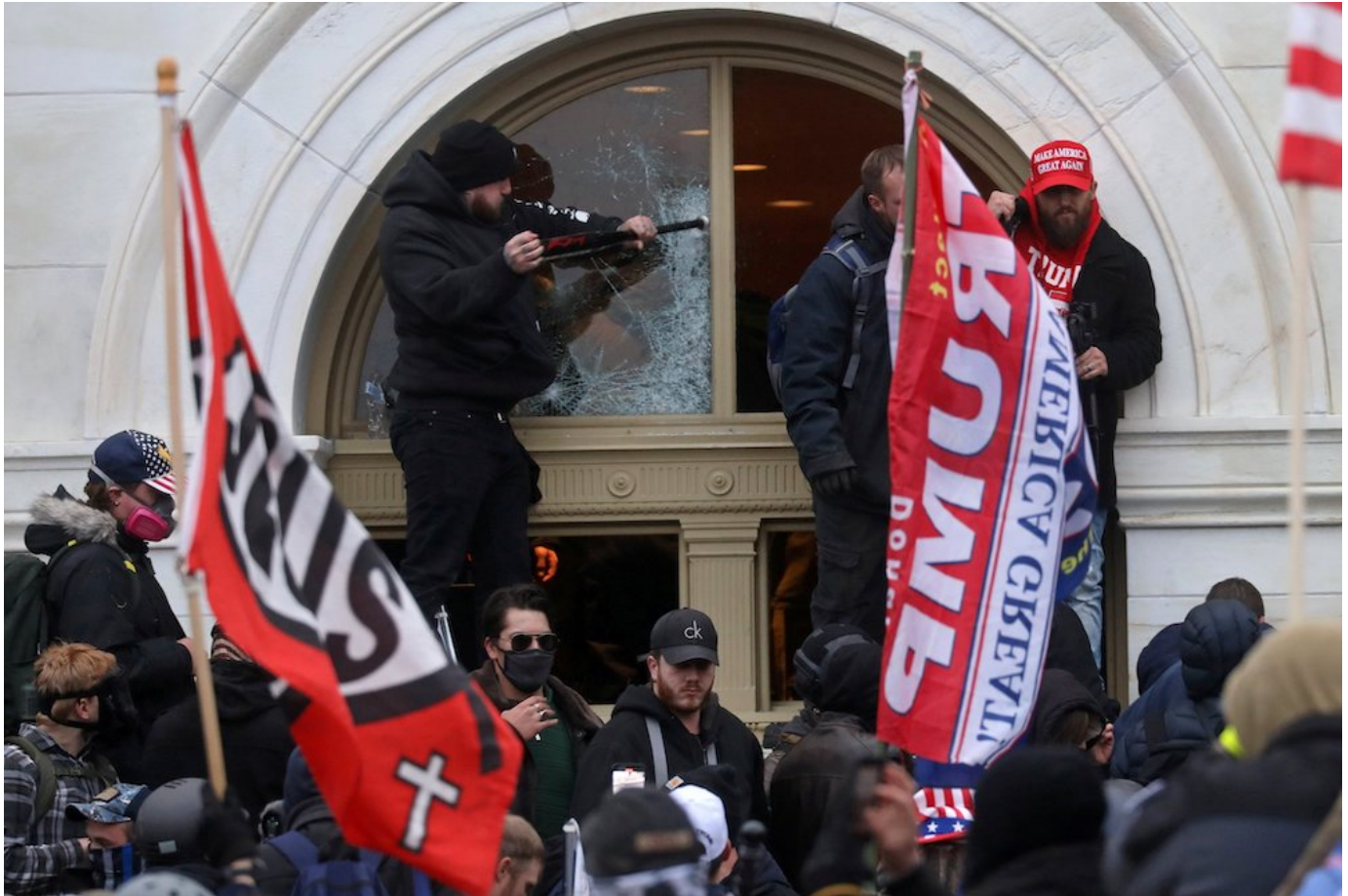
A President Donald Trump supporter breaks a window at the U.S. Capitol in Washington Jan. 6, 2021.