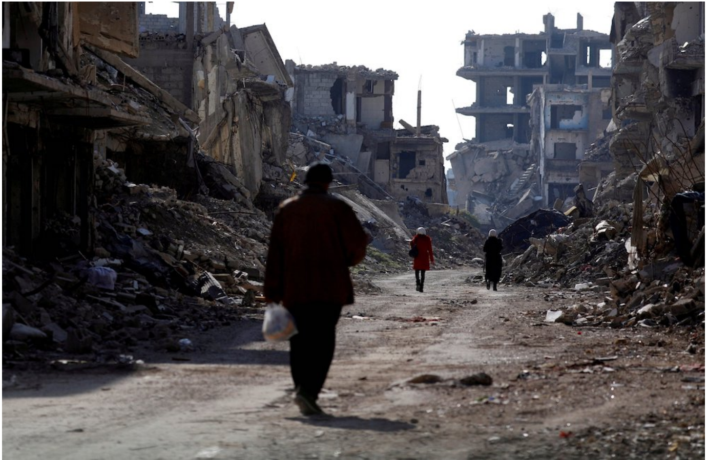
People walk past damaged buildings at the Yarmouk Palestinian refugee camp on the outskirts of Damascus, Syria Dec. 2.

displacement throughout the region that has had significant ancillary effects and impacts, all grounded in what might be one of the most important climate-driven conflicts of recent times.