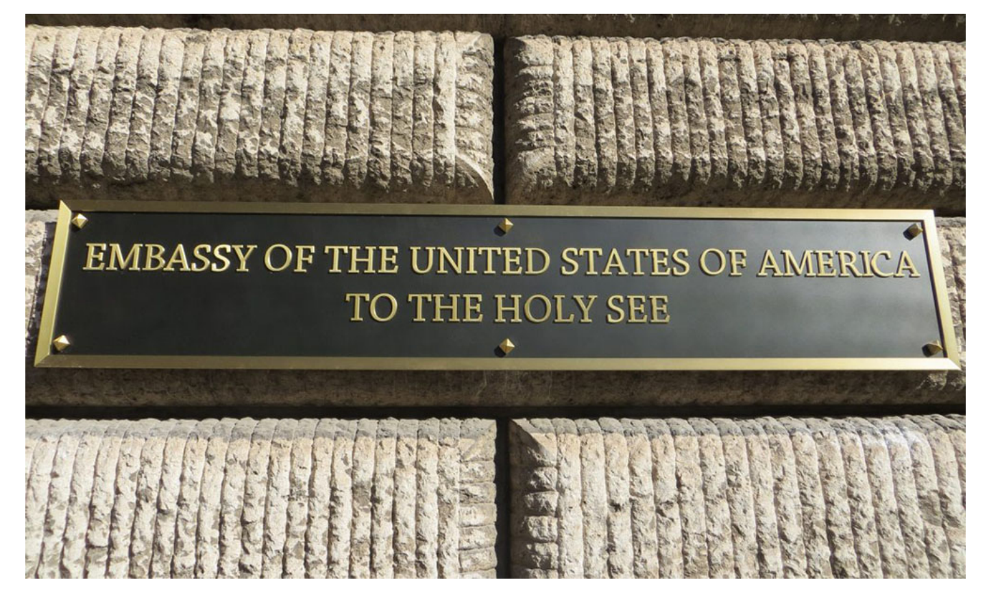
The U.S. Embassy to the Holy See in Rome (U.S. Embassy to the Holy See)

The history of U.S.-Holy See diplomacy traces back to 1788 and a request made by Pope Pius VI to Benjamin Franklin. The story is told that the pope dispatched his emissary to Paris to ask Franklin if George Washington would be fine with the appointment of a Catholic bishop in the United States. Washington sent word back informing the pope that he was free to name whoever he wanted since it was precisely as a result of religious freedom that the revolution in the colonies had taken place. That conversation set in motion a long and fruitful history of U.S.-Holy See relations.