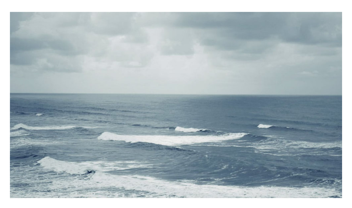
A still from Sky Hopkina's film "małni – towards the ocean, towards the shore"

The cyclic ebb and flow of life, death and afterlife inspirit "main" (pronounced "moth-nee"), the first feature-length film of Indigenous American artist and filmmaker Sky Hopinka, who is credited for direction, cinematography and editing, among others. Of Ho-Chunk and Pechanga ancestry, Hopinka is known for previous works that consisted of experimental, often biographical docu-shorts, intimately focused on Native American reflections.