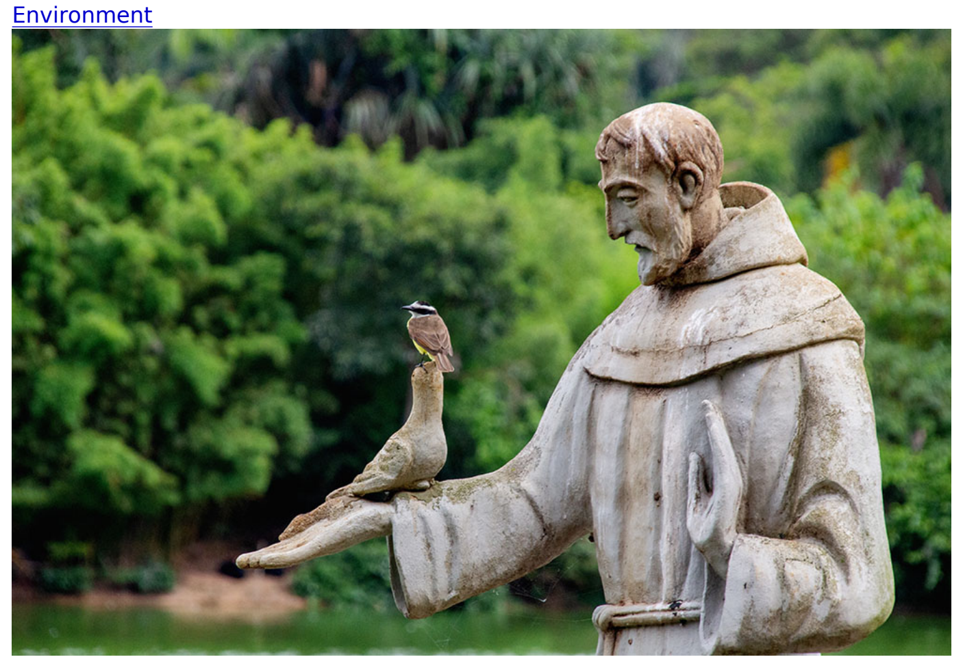
São Paulo Zoo, Brazil

EarthBeat Spirituality Faith Spirituality