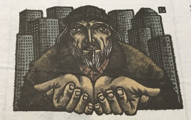
In downstairs church, their longings were basic and bodily: to be touched and listened to and looked at with love.

d career possibilities. ould take years to find a Catholic mity that would hire me as astoral associate. When the urrived, I was welcomed to the a Jesuit parish in New York of for its ministry to the poor ay and lesbian communities. gregation had a phenomenon referred to as "upstairs ad "downstairs church." Upch was the sanctuary itself,