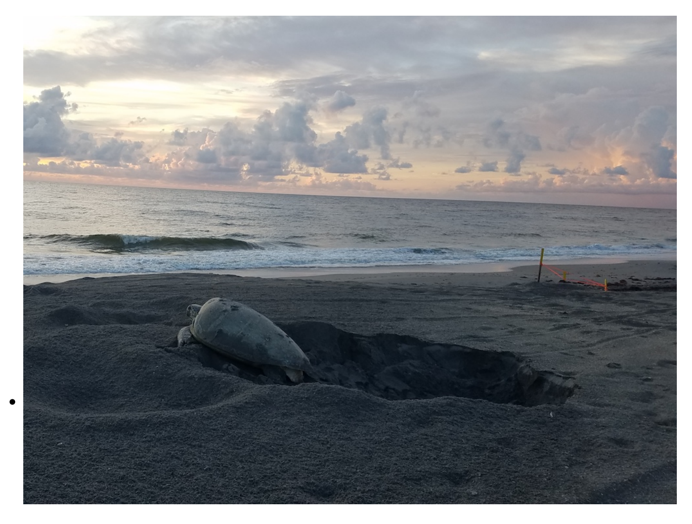
A green sea turtle, "Chelonia mydas," heads back to the water after nesting, June 14, 2020.

A sea turtle nest is marked by orange tape to protect it from beachgoers. Helped by conservation measures, monitoring and research, sea turtles are still nesting along Florida beaches despite development pressures.