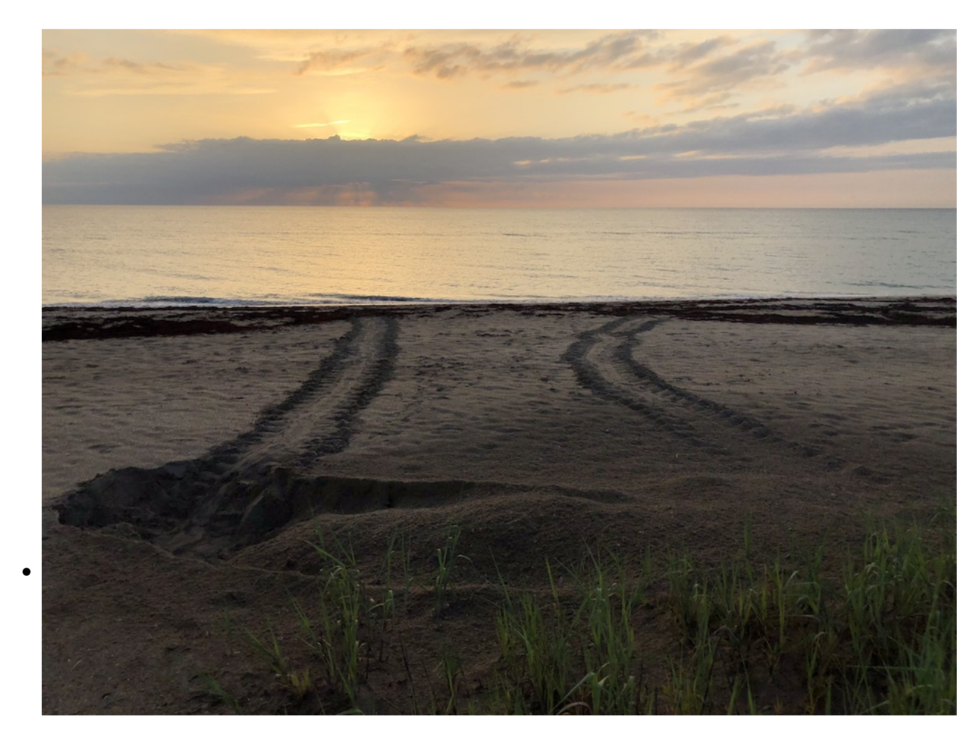
Turtle tracks lead back to the water from a pair of green sea turtle, "Chelonia mydas," nests, July 9, 2020.

A drive along coastal highway A1A clearly shows the tougher development restrictions in Martin County, which limited the density and height of buildings and required set-asides for plenty of public-access beaches, compared with the towering condos and more limited beach access in St. Lucie County. Members of my family settled in Martin County more than 40 years ago, and I lived and reported in the region for The Miami Herald in the mid-80s during my decades-long stint as a journalist in South Florida before moving to the Washington, D.C., area in 2011. Over the years, I've witnessed the increasing development, which is why it was reassuring that the sea turtles were also claiming their part of the beach.