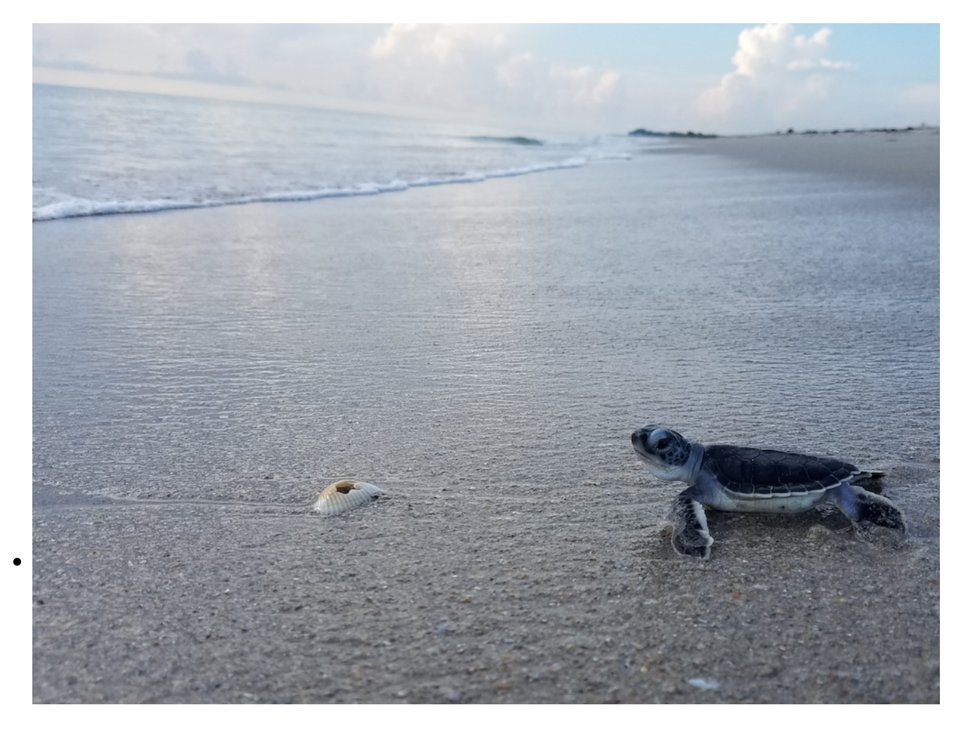
A green sea turtle hatchling, "Chelonia mydas," Aug. 30, 2020