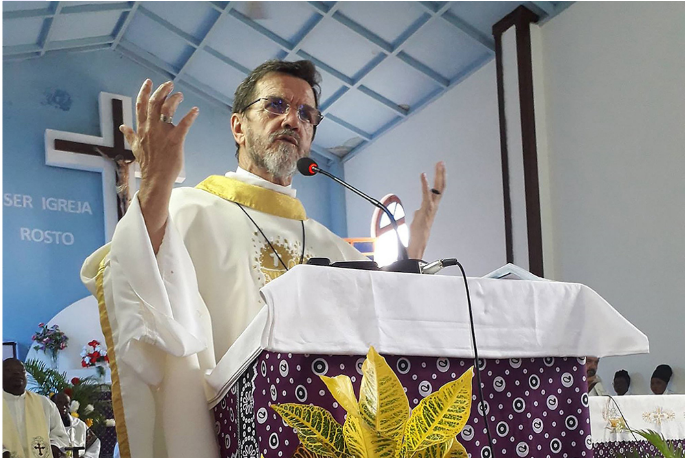
Bishop Luiz Lisboa of Pemba, Mozambique, is pictured in an undated photo.