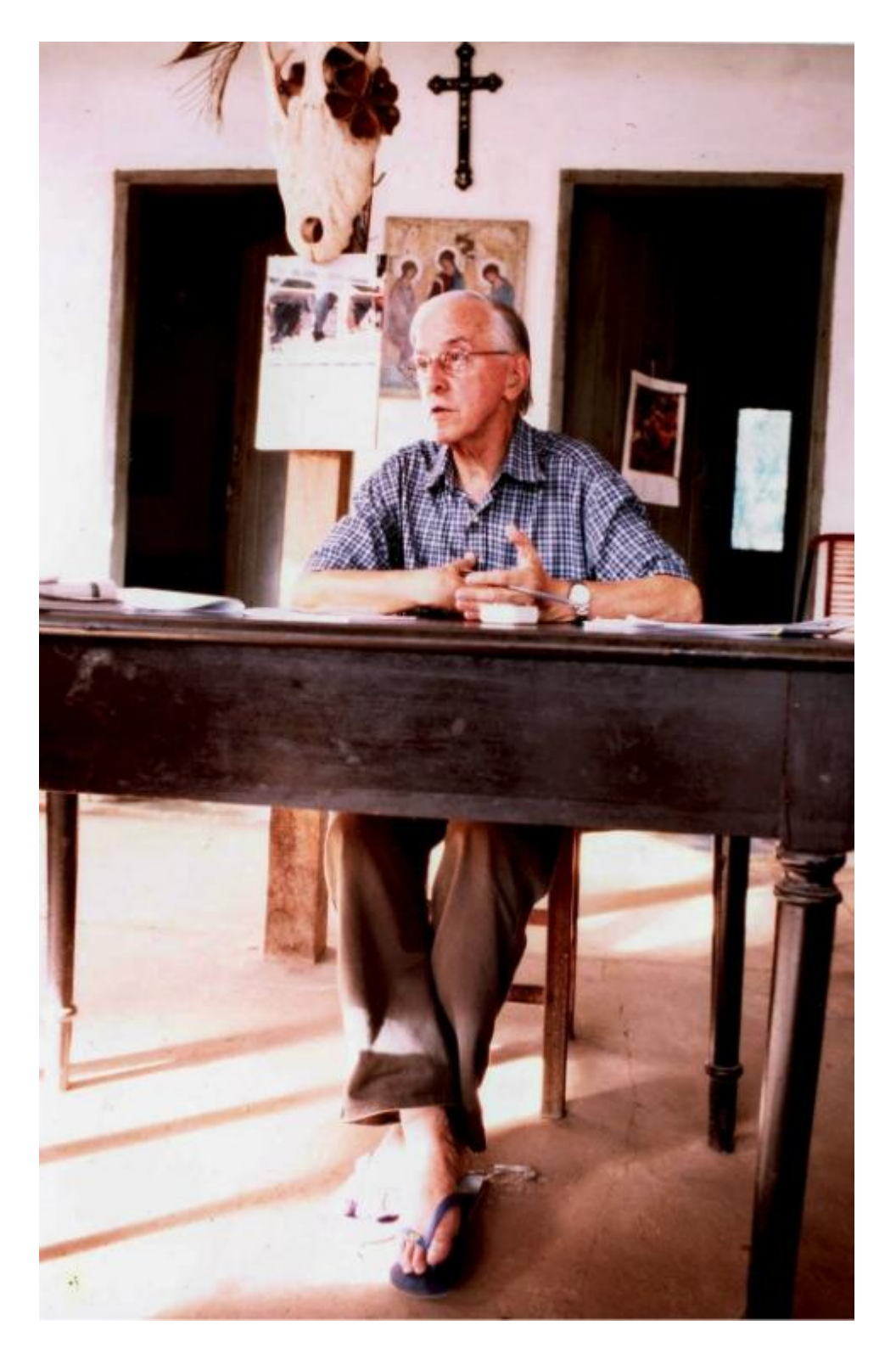
Retired Bishop Pedro Casaldáliga in an undated photo.

Known in Brazil as the "bishop of the poor," retired Bishop Pedro Casaldáliga Pla, 92, died in São Paulo Aug. 8 due to respiratory problems arising from pneumonia.