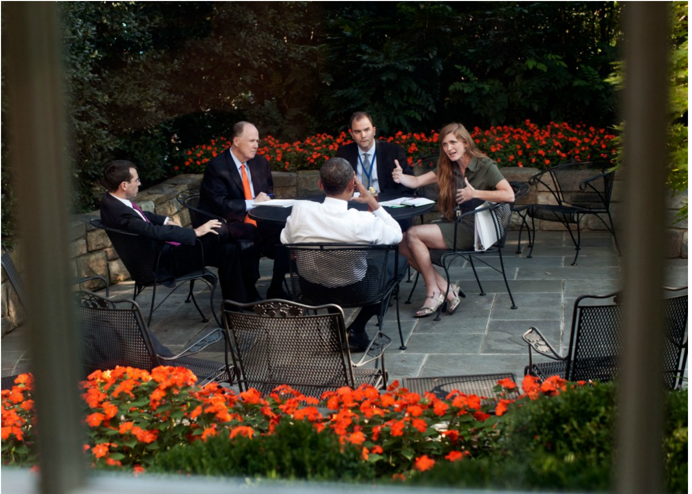
President Barack Obama meets with advisers, including Samantha Power (right), on the patio outside the Oval Office, Sept. 14, 2011.