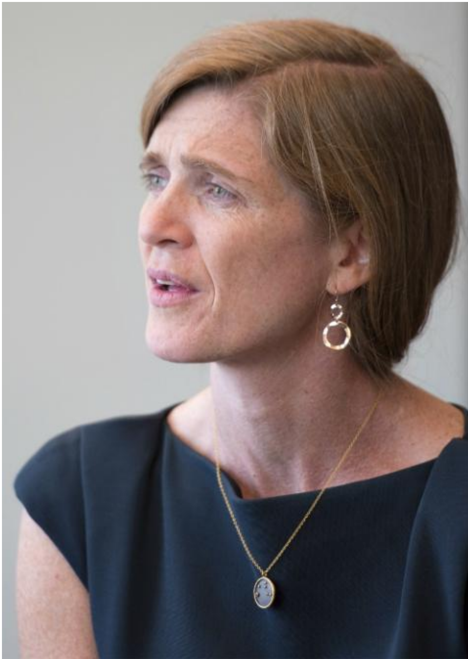
Samantha Power at the United Nations in June 2016

Before Power and others in the White House flew to Oslo with the president for the Nobel ceremony and acceptance speech, she was in the Oval Office to share her feelings in a lengthy memo on "warfare and morality" and notions that came to her when she recalled the writings of Reinhold Niebuhr, a theologian and champion of