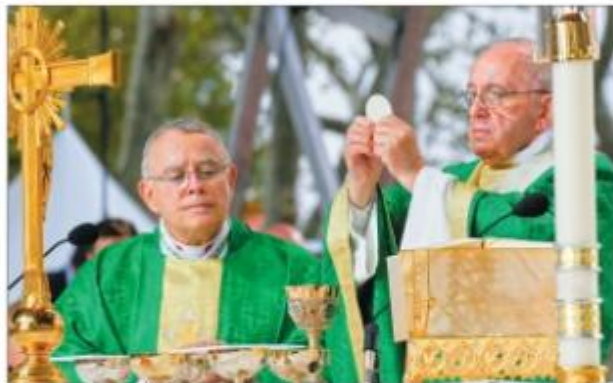
Pope Francis, right, raises the Eucharist as he celebrates the closing Mass of the World Meeting of Families in Philadelphia in 2015. With him at the altar is Philadelphia Archbishop Charles Chaput.