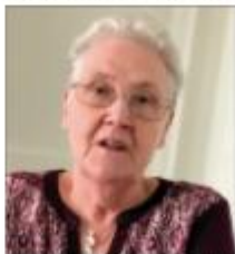
Marie Collins

"The church is at a crossroads. It can either continue to behave as it has for centuries, protecting itself, or open up and become the church we all want it to be, the church that it should be."