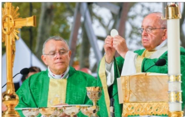
Pope Francis, right, raises the Eucharist as he celebrates the closing Mass of the World Meeting of Families in Philadelphia in 2015. With him at the altar is Philadelphia Archbishop Charles Chaput.