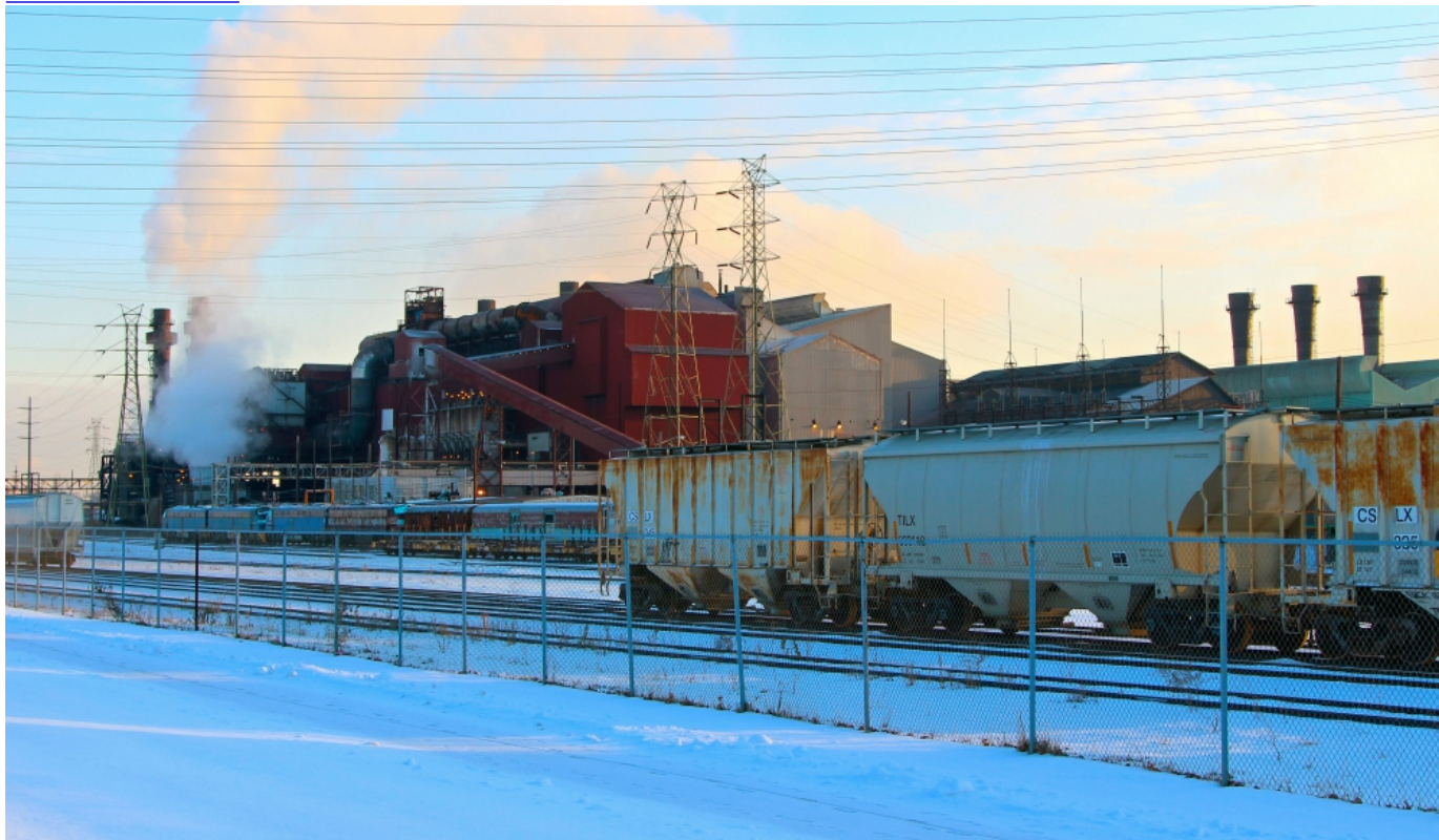
View of the ArcelorMittal steel mill in Cleveland, 2016