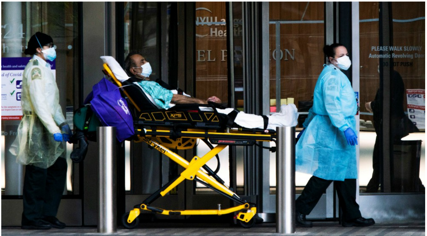
Health care workers move a patient at NYU Langone Hospital in New York City May 3, amid the coronavirus pandemic.