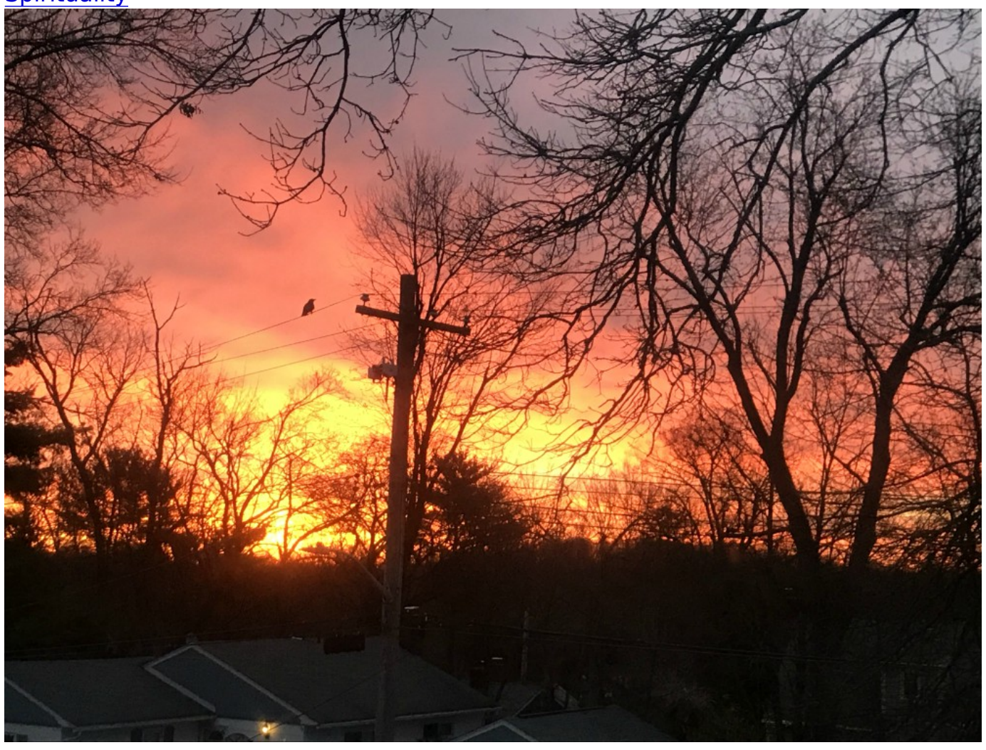
Westchester County, New York