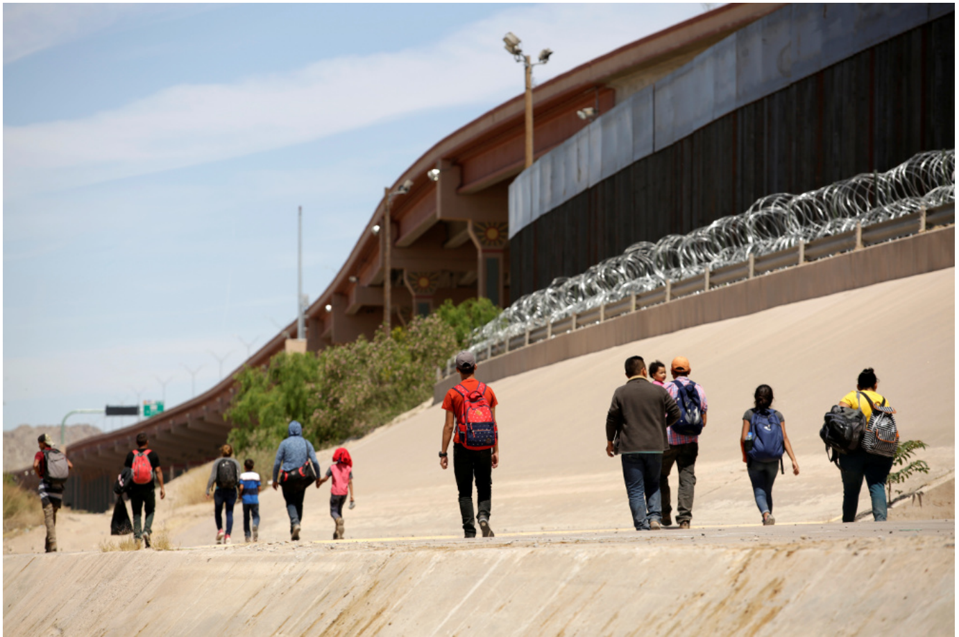
Migrants walk after crossing the Bravo River at the border line between Ciudad Juárez, Mexico, and El Paso in Texas, U.S., as seen May 9 from Ciudad Juárez.

Her innocent question reminds me of the parable of the rich man and Lazarus (Luke 16:19-31). The rich man didn't exactly turn Lazarus away. Nor cause him any further harm. He simply kept Lazarus outside his property, ignored him, wouldn't give him the scraps that fell from his table. Yet Jesus said the man's inactions caused him to suffer torment in the afterlife.