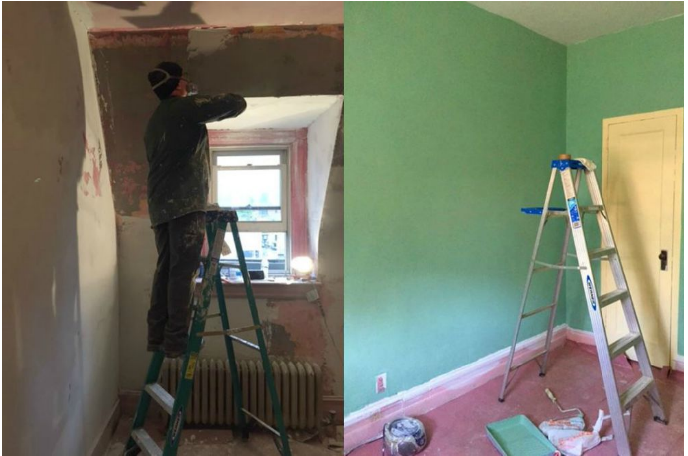
Left: Many of the small bedrooms at the former convent were in significant disrepair; right: A bedroom pictured after restoration