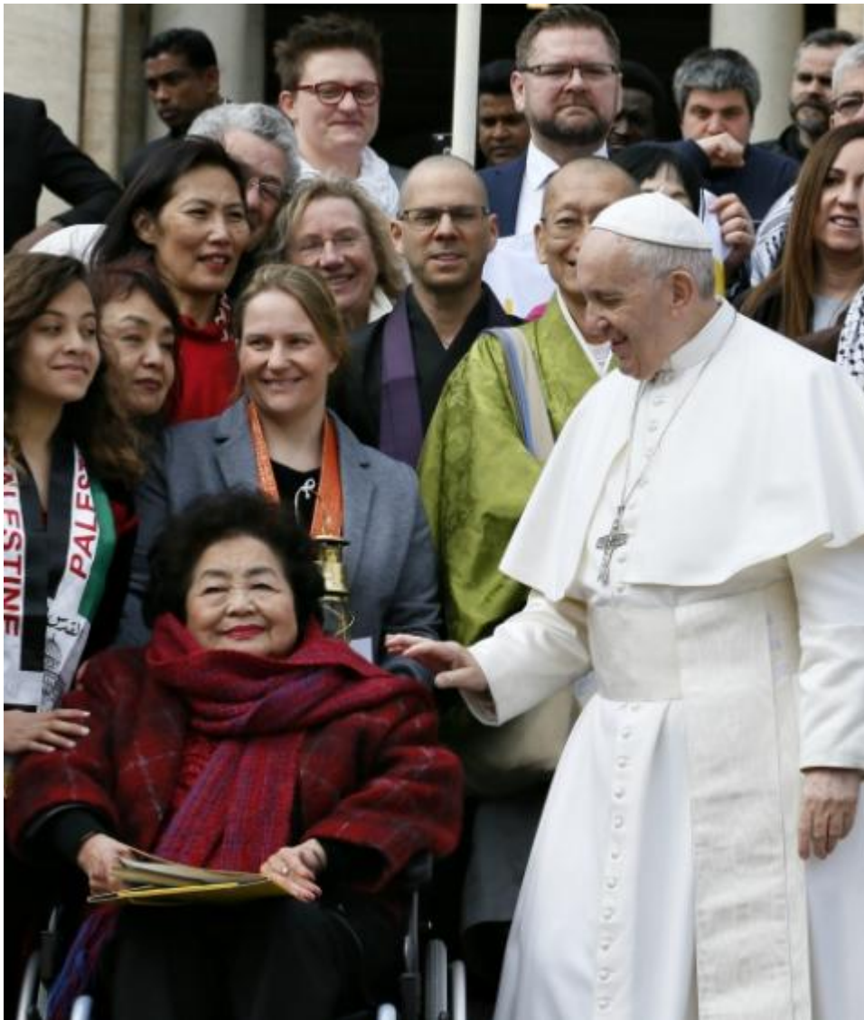
Pope Francis greets Setsuko Thurlow, a survivor of the 1945 atomic bombing in Hiroshima, Japan, during his general audience in St. Peter's Square at the Vatican March 20.

I was astonished by this statement! By implication, the judge was clarifying how the civil law of the United States protects nuclear weapons. Even though the use of such weapons poses an unprecedented peril for our world, the "law's" sanctioning them cannot be questioned. In short, the use of nuclear weapons, which could end the world as we know it, would be technically lawful.