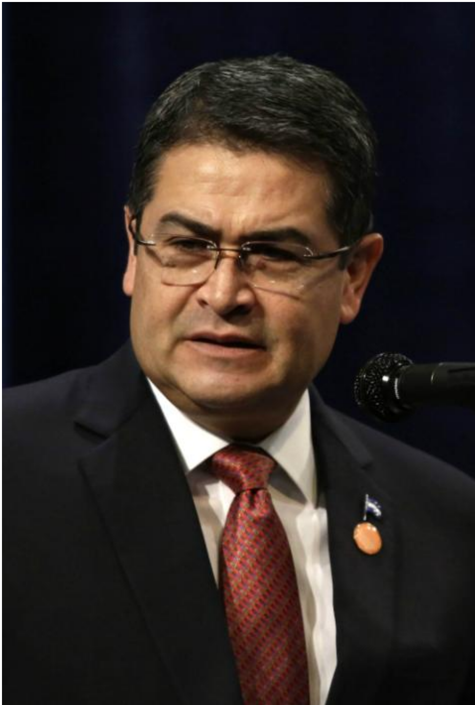
Honduras President Juan Orlando Hernández