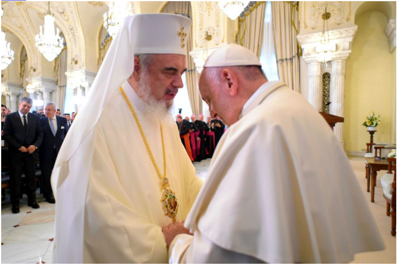
Pope Francis meets with Romanian Orthodox Patriarch Daniel at the patriarchal palace in Bucharest, Romania, May 31.