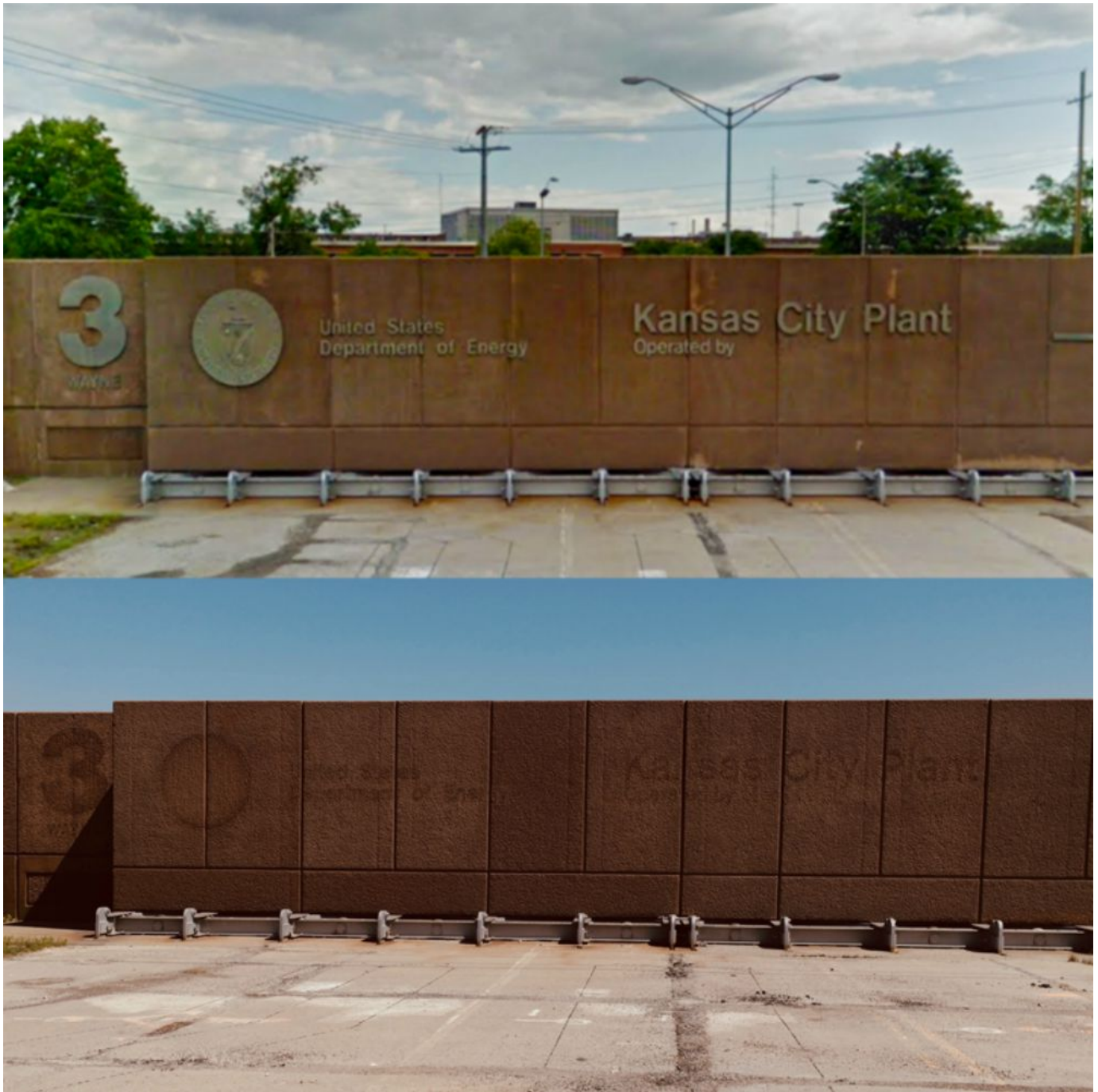
The Kansas City Plant gates before 2017, top, and today, May 2019