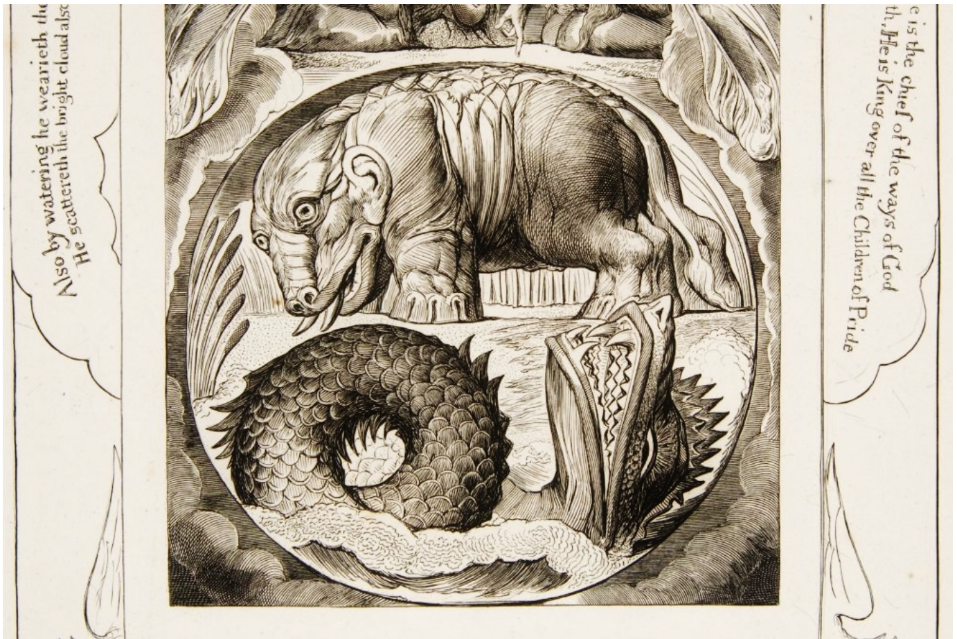
"Behemoth and Leviathan," from Illustrations of the Book of Job, engraving by William Blake, 1825-26

The Hebrew Scriptures tell us that God has been battling chaos since the very beginning. God, who desires order, continues to battle chaos to this day. Sometimes God wins; sometimes God loses.