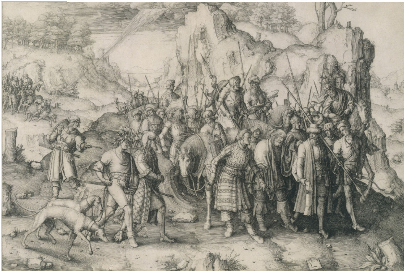
"The Conversion of St. Paul," engraving by Lucas van Leyden, 1509

Opinion Spirituality Culture Book Reviews