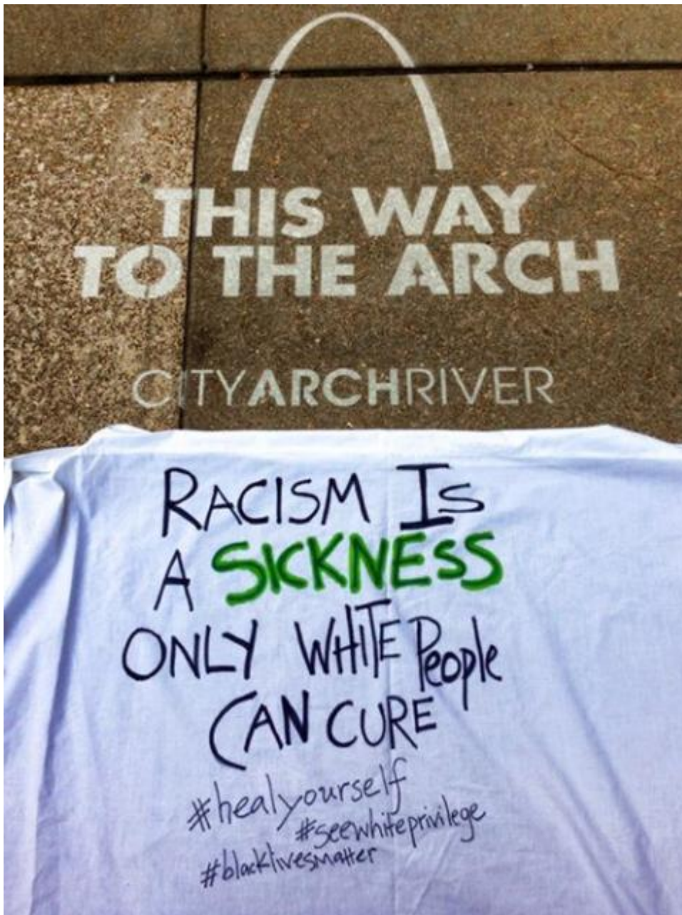
A banner at the Ferguson October Weekend of Resistance, a national mobilization in St. Louis in 2014. (Sarah Griesbach)

As remedies, the letter suggested increased reflection and discussion about racism, following the lead of people of color, examining neighborhood dynamics and using white groups' often greater access to resources to support people of color.