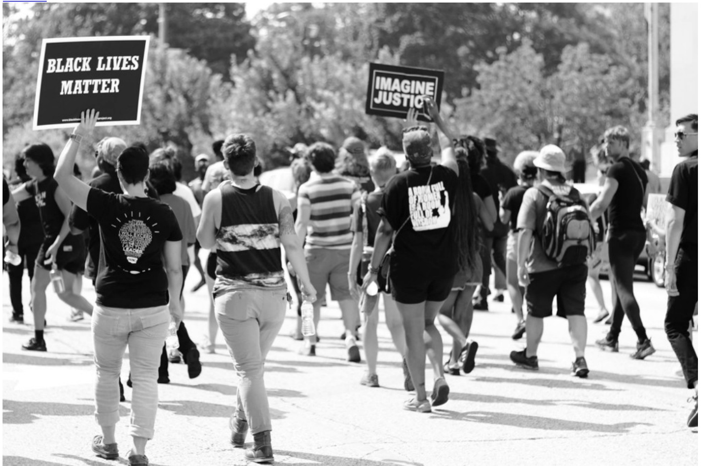
Participants at a 2017 Black Lives Matter demonstration in St. Louis. (Kristen Trudo)