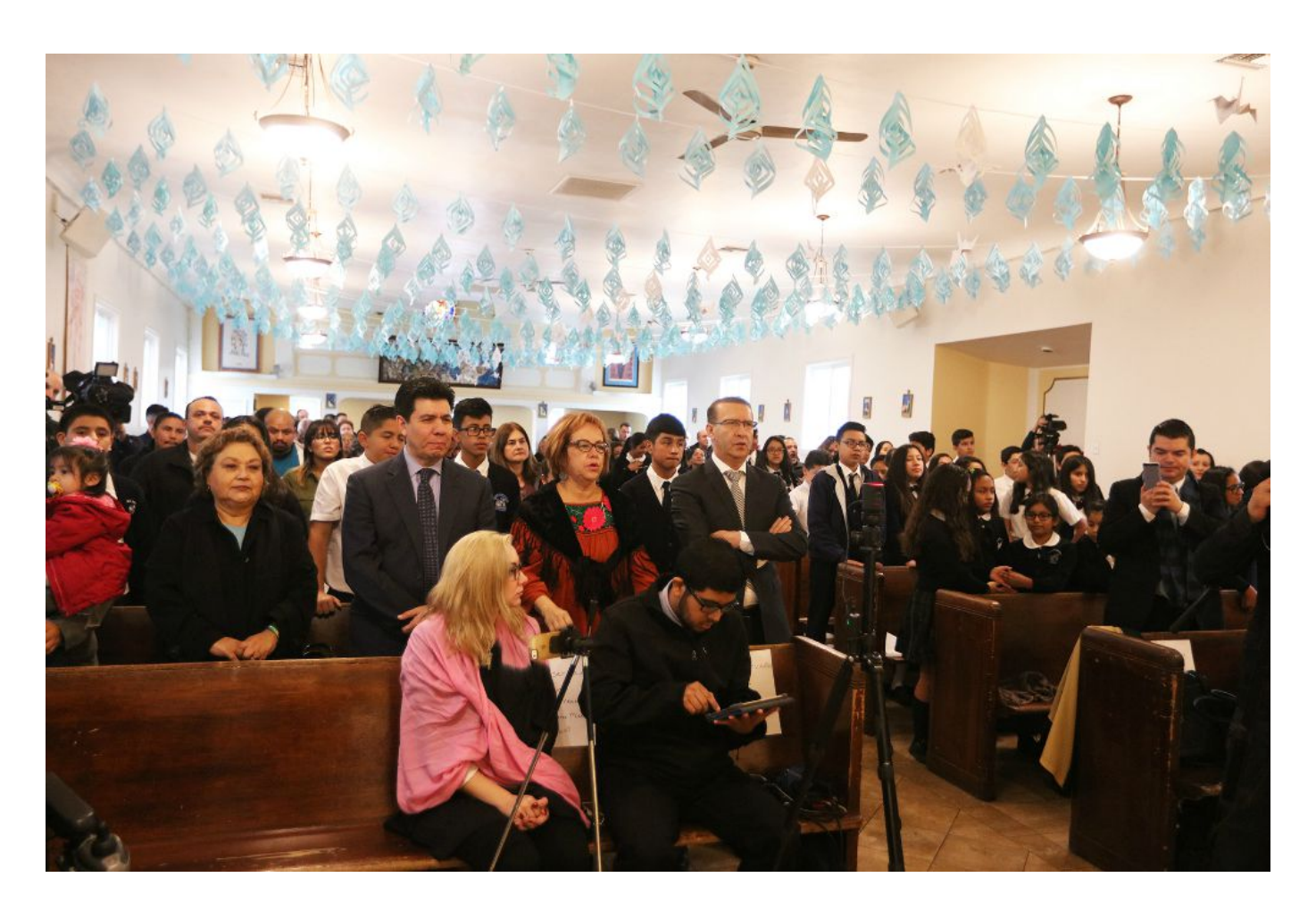
Mass at Dolores Mission Church, Jan. 11, 2017