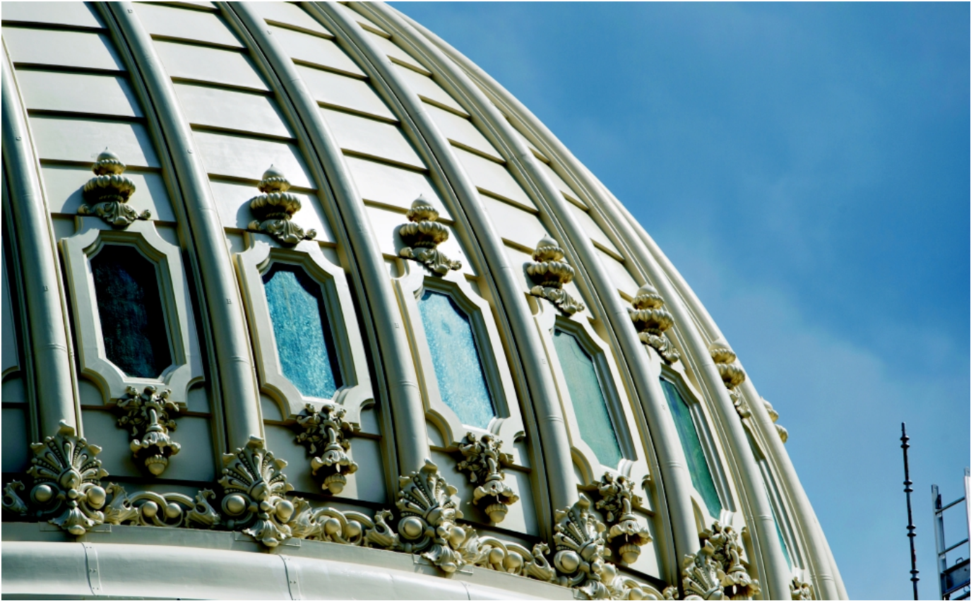
The Capitol dome in Washington, D.C.