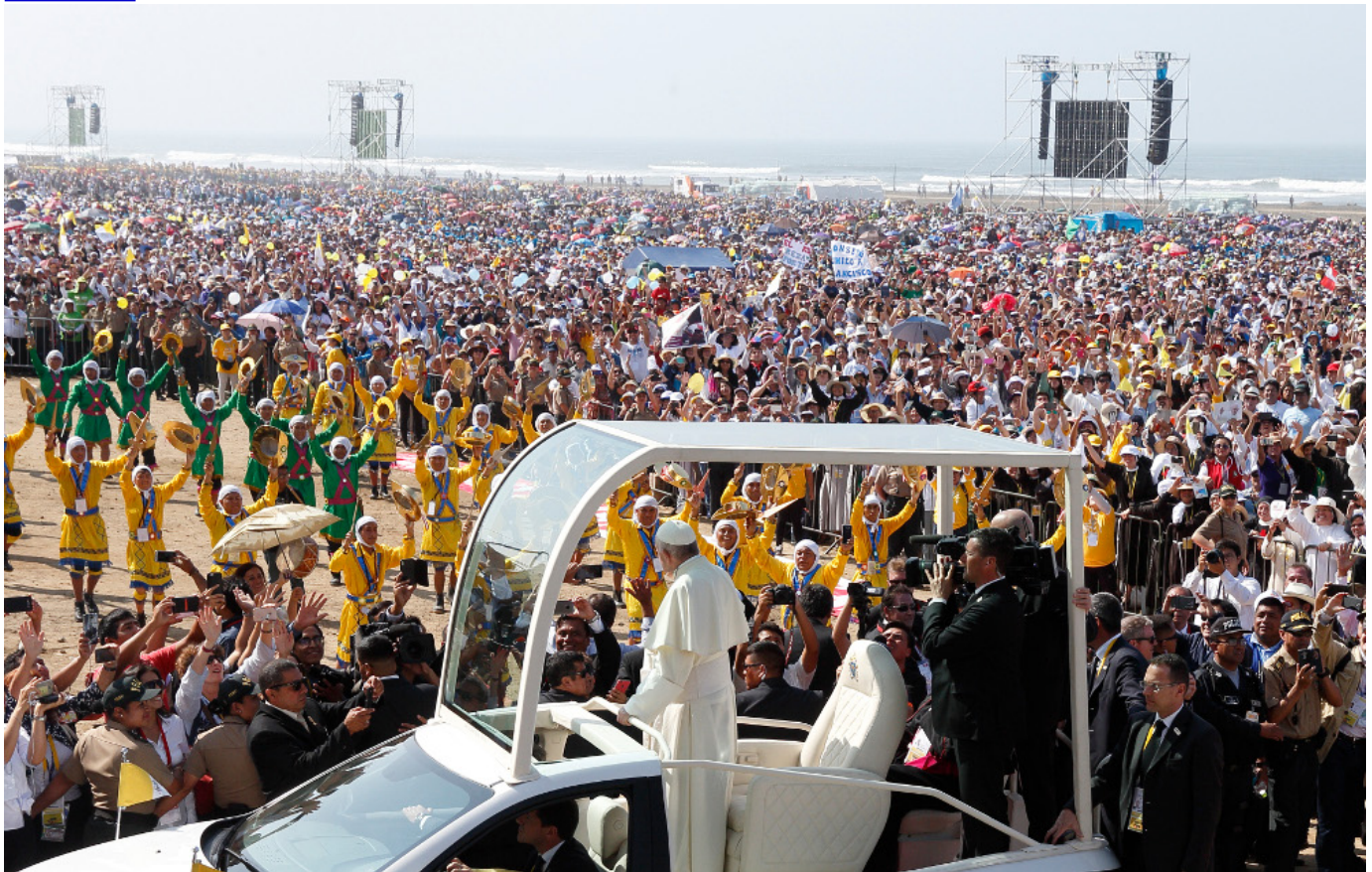
Pope Francis greets the crowd before celebrating Mass at the beach in Huanchaco, Peru, Jan. 20.