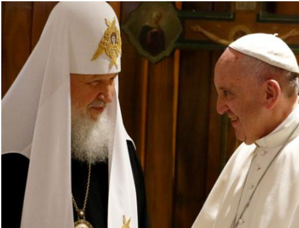
Russian Orthodox Patriarch Kirill of Moscow and Pope Francis smile during a 2016 meeting at José Martí International Airport in Havana.

However this is argued, Rome has some powerful assets to deploy in pursuit of its initiatives.