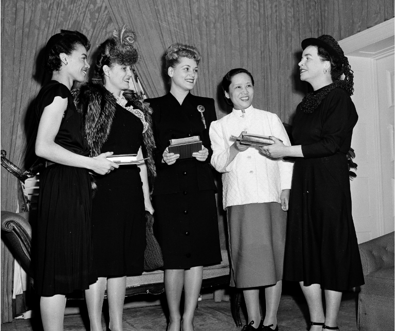
Pauli Murray, left, then a New York lawyer, receives a Mademoiselle Merit award Dec. 30, 1946, as one of 10 young women selected by Mademoiselle magazine as "Young Women of the Year."